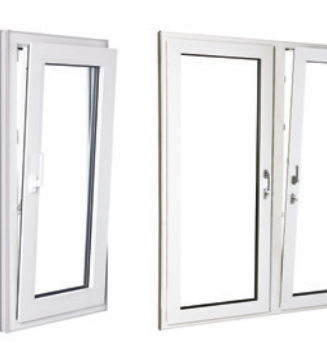
Single or combined tilt and turn window

Strassburger Tilt and Turn windows and doors are designed for maximum brightness and unimpeded views with a unified and consistent look that makes them ideal to pair with existing windows and doors.